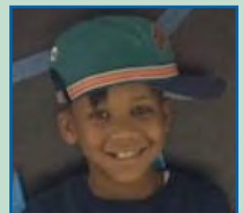
Young fans with The Big Brothers Big Sisters Organization enjoying a Marlins game!